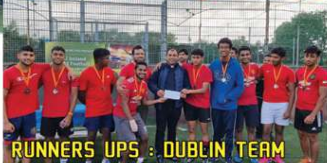
RUNNERS UPS : DUBLIN TEAM