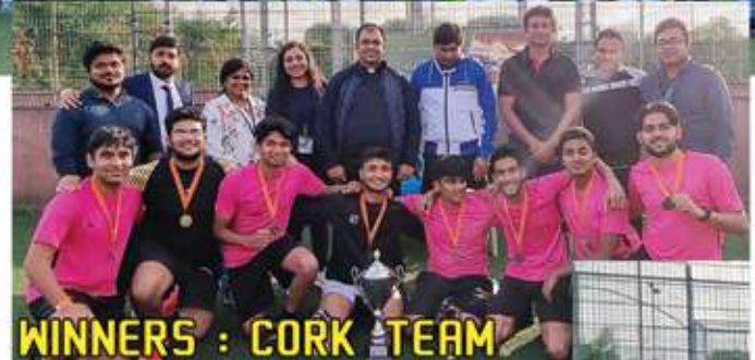
WINNERS : CORK TEAM